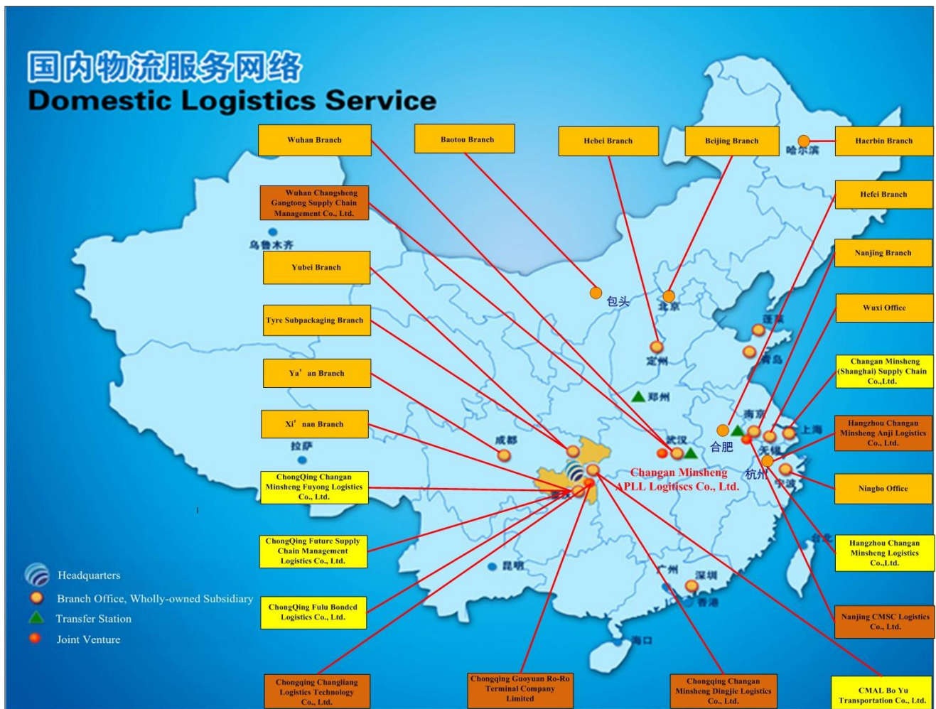
Picture 2: Location of the Company's existing branches, subsidiaries and representative offices

As at 31 December 2018, the Company had a total of 25 branches, subsidiaries, associated companies and representative offices, which are mainly located in East China, Central China, North China, South China and Southwest China (Picture 2). The continuous enhancement of service network enables the Group to provide logistics services to different parts of the country.